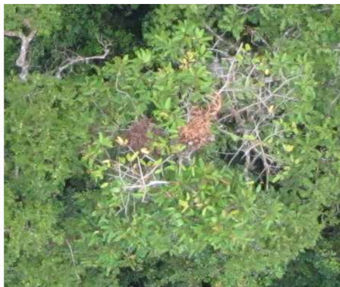
Rhinoceros in Nepal and orangutan nests in Sumatra, Indonesia.