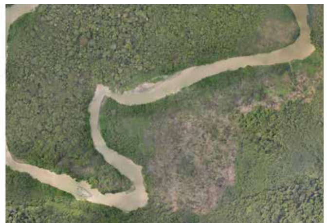
Deforestation in Sumatra, Indonesia, can be seen in the bald patches in the right image.