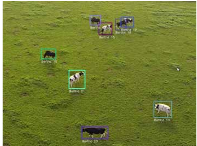
An example of animal detection with computer vision algorithms.

Monitoring changes in land cover is one of the key tasks for conservation. Such monitoring entails determining whether certain land covers such as pristine rainforest are being converted to other land covers such as oil palm plantations or are being degraded by logging. Most of this monitoring is currently conducted by analyzing satellite images. The resolution of satellite images continues to improve, as does the frequency with which satellite images are captured.